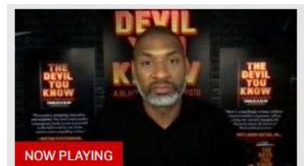
Charles Blow: Why Black Americans Should Migrate Back South

moved to Atlanta. In his new book, "The Devil You Know: A Black Power Manifesto," he proposes that Black Americans in the north do the same and return to the South — the region fled by their ancestors — with the intention of establishing political power in key cities. Blow joins Hari Sreenivasan to