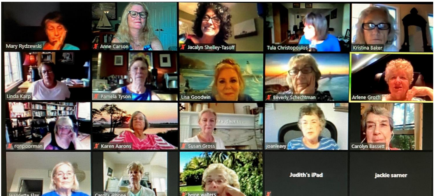
Some of our participants and presenters