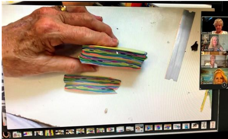
Arlene demonstrates techniques used with polymer clay to create beautiful jewelry.