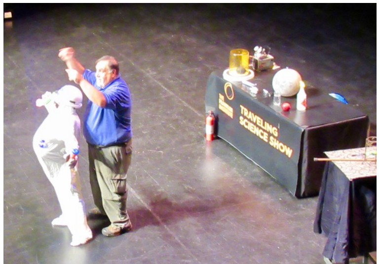
Franklin Institute On Living Space