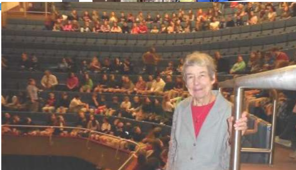
Ushering at Stockton Children's Theatre