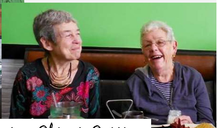
Ethnic Luncheon Group — Chinese Cuisine