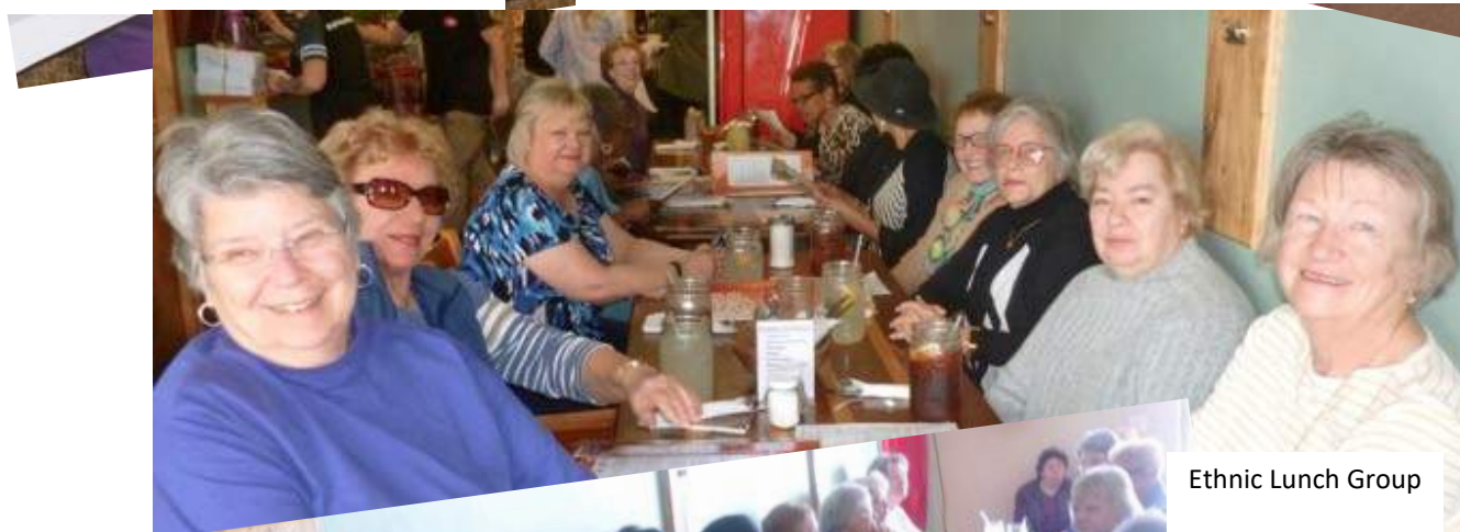
Ethnic Lunch Group