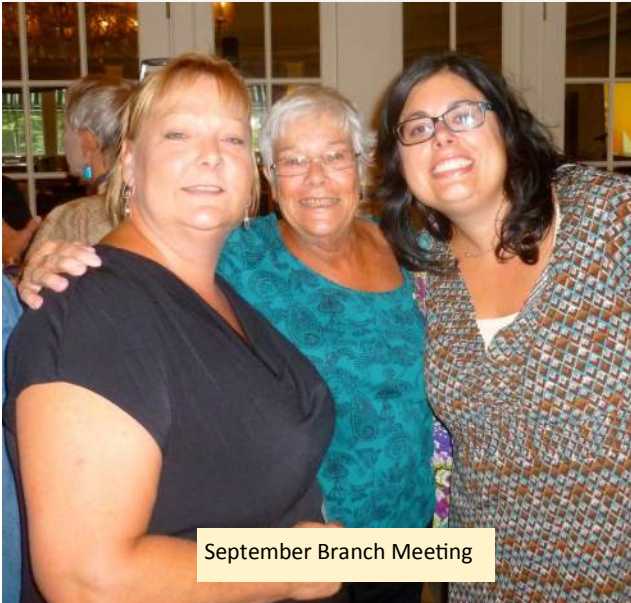
September Branch Meeting