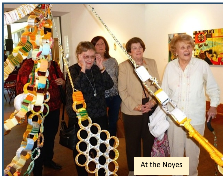
At the Noyes

Here's an opportunity to meet other NJ Branch members and discuss pertinent matters related to women's issues.