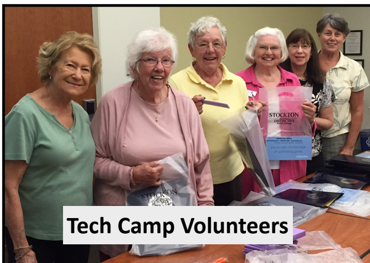
Tech Camp Volunteers

Please email PHYLLIS LPTRACKMAN@COMCAST.NET by Oct. 9 if you wish to attend