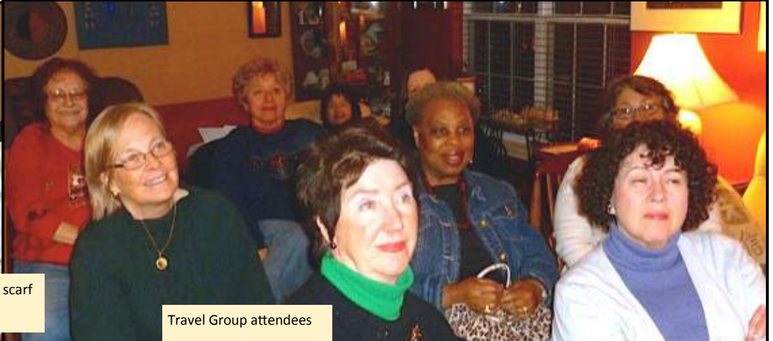
Travel Group attendees