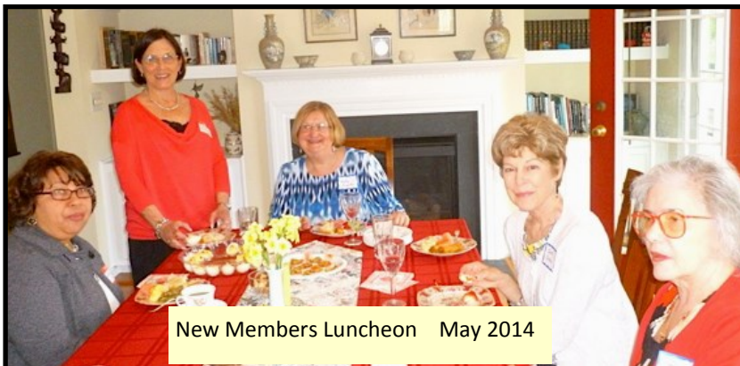
New Members Luncheon May 2014

921 Park Place #611 Gardens Plaza, Ocean City, NJ 08226 Phone: 413 429-1132 coffmanjoyce@gmail.com Trenton State Col-lege: Business Ad- min/