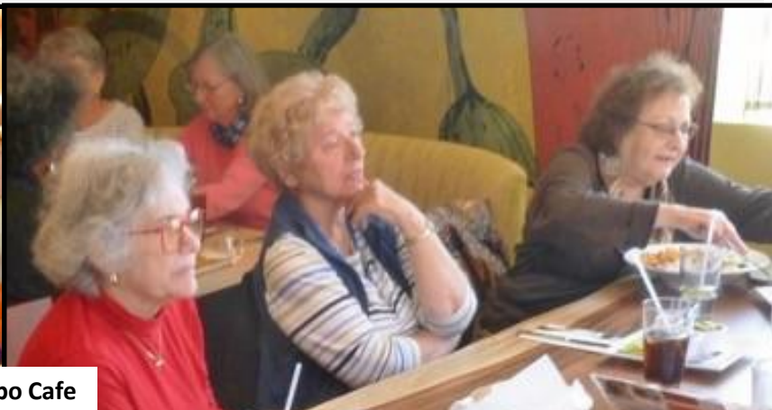
Ethnic Cuisine at Mambo Cafe