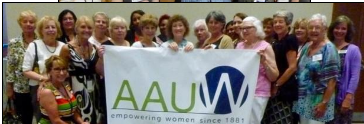
Tech Trek Camp: Atlantic County volunteers and students, July 2016