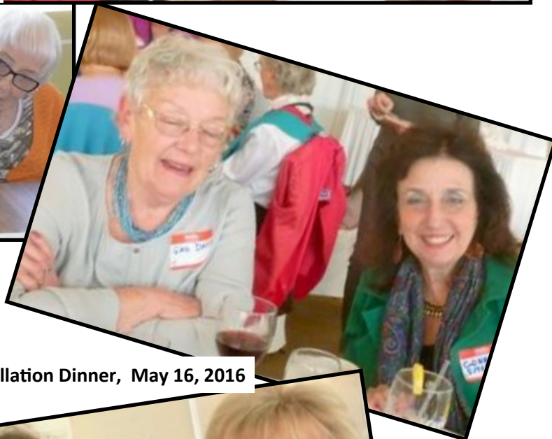
Installation Dinner, May 16, 2016