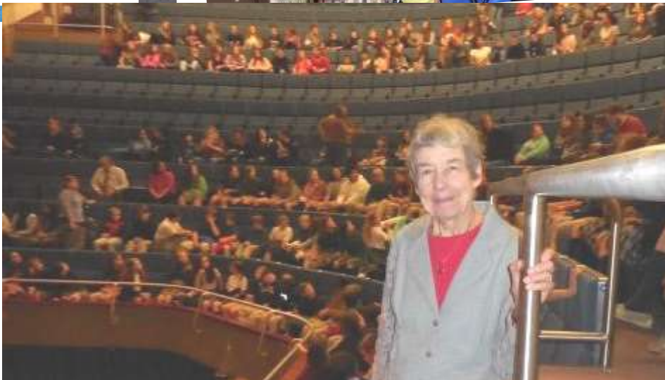
Ushering at Stockton Children's Theatre