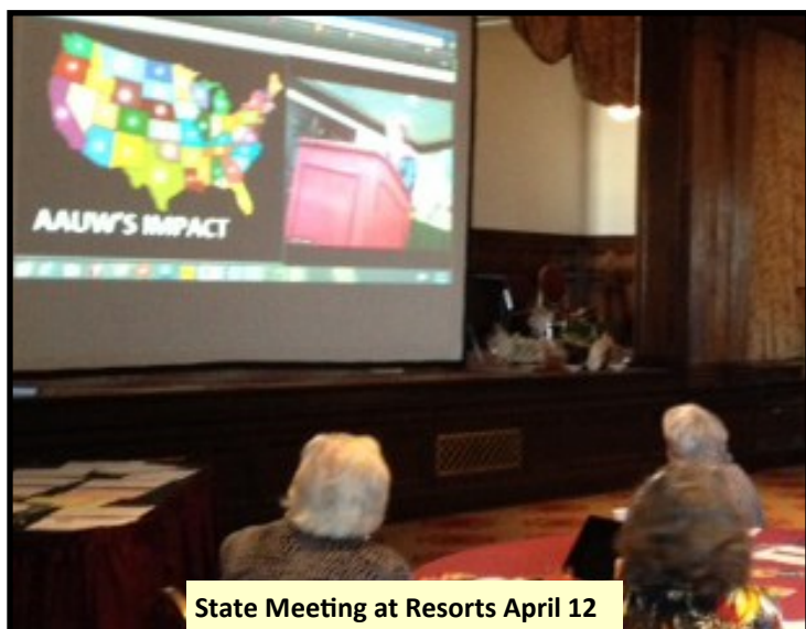
State Meeting at Resorts April 12

Use the tear off on the following page to register and indicate your menu selection no later than May 10 . Guests are welcome.