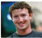
Mark Zuckerberg Founder, Facebook

Our policy at Facebook is literally to hire as many talented engineers as we can find. There just aren't enough people who are trained and have these skills today.