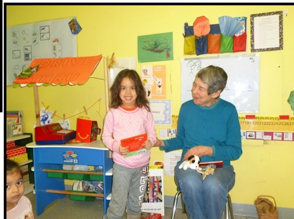
Students getting books as part of Ready,Set,Read program (AAUW is partnering with Women's Leadership Initiative)