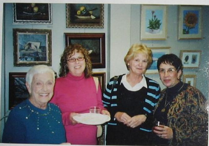
Ocean City Fine Arts League