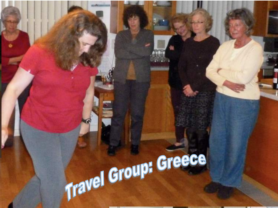
Travel Group: Greece