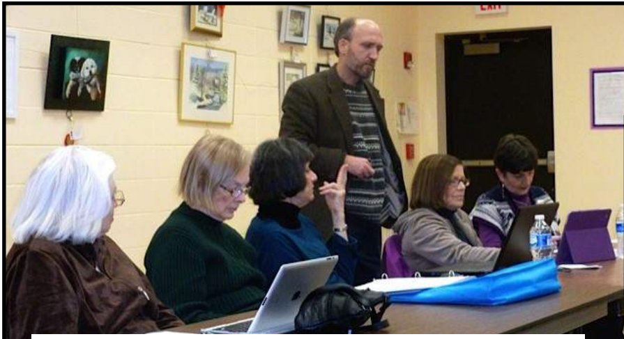
Technology Question and Answer session at the Galloway Branch of the Atlantic County Library